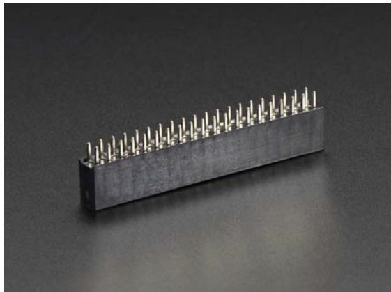
Female SKU: PIS-0243