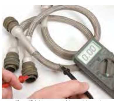
Flexo Shield can provide end-to-end shielding solution on your application.