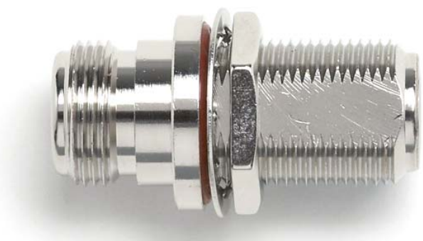
Model 73045 N Type Jack to Jack Bulkhead Adapter, Pressurized