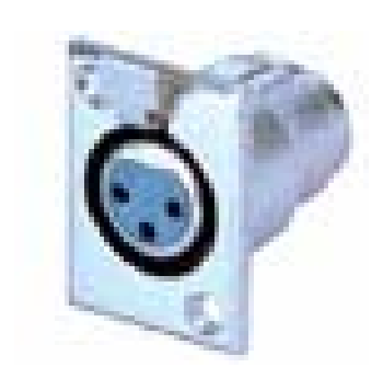
Model 5113A XLR (F) 3-pin rectangular flanged mount